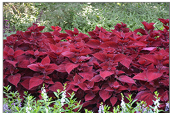
Beale Street Coleus