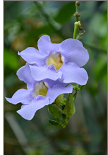
Blue Trumpet Vine flowers