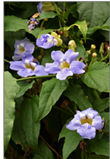
Blue Trumpet Vine flowers