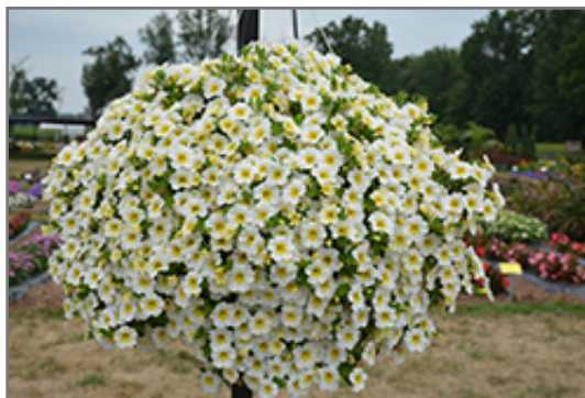
MiniFamous Neo White + Yellow Eye Calibrachoa in bloom

MiniFamous Neo White + Yellow Eye Calibrachoa is a fine choice for the garden, but it is also a good selection for planting in outdoor containers and hanging baskets. Because of its trailing habit of growth, it is ideally suited for use as a 'spiller' in the 'spiller-thriller-filler' container combination; plant it near the edges where it can spill gracefully over the pot. Note that when growing plants in outdoor containers and baskets, they may require more frequent waterings than they would in the yard or garden.