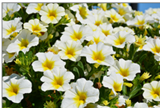
MiniFamous Neo White + Yellow Eye Calibrachoa flowers

This plant will require occasional maintenance and upkeep. Trim off the flower heads after they fade and die to encourage more blooms late into the season. It is a good choice for attracting bees and hummingbirds to your yard, but is not particularly attractive to deer who tend to leave it alone in favor of tastier treats. It has no significant negative characteristics.