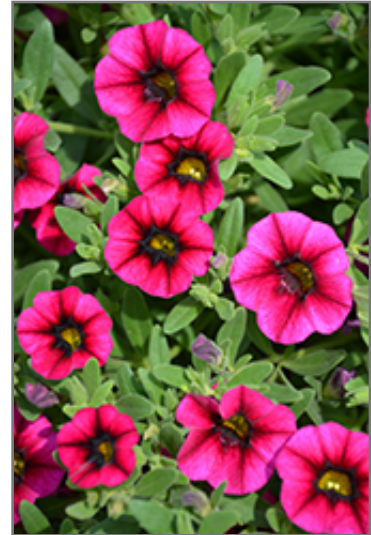
Kimono Black Dragon Calibrachoa flowers

Kimono Black Dragon Calibrachoa is recommended for the following landscape applications;