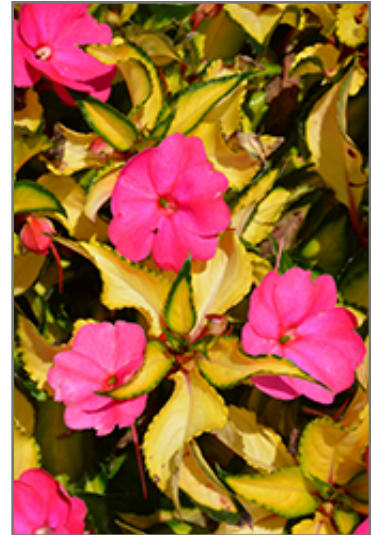
SunPatiens Compact Tropical Rose New Guinea Impatiens flowers

SunPatiens Compact Tropical Rose New Guinea Impatiens is recommended for the following landscape applications;