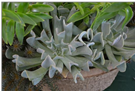
Topsy Turvy Echeveria

This is a dense herbaceous evergreen houseplant with tall flower stalks held atop a low mound of foliage. Its relatively fine texture sets it apart from other indoor plants with less refined foliage. This plant should not require much pruning, except when necessary to keep it looking its best.