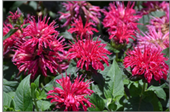
Balmy Rose Beebalm flowers

Balmy Rose Beebalm is recommended for the following landscape applications;