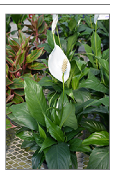
Sensation Peace Lily in bloom

When grown indoors, Sensation Peace Lily can be expected to grow to be about 5 feet tall at maturity, with a spread of 3 feet. It grows at a medium rate, and under ideal conditions can be expected to live for approximately 10 years. This houseplant performs well in both bright or indirect sunlight and strong artificial light, and can therefore be situated in almost any well-lit room or location. It prefers to grow in average to moist soil. The surface of the soil shouldn't be allowed to dry out completely, and so you should expect to water this plant once and possibly even twice each week. Be aware that your particular watering schedule may vary depending on its location in the room, the pot size, plant size and other conditions; if in doubt, ask one of our experts in the store for advice. It is particular about its soil conditions, with a strong preference for rich, acidic soil. Contact the store for specific recommendations on pre-mixed potting soil for this plant. Be warned that parts of this plant are known to be toxic to humans and animals, so special care should be exercised if growing it around children and pets.