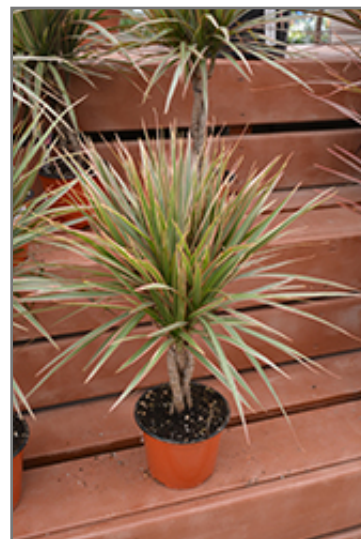
Colorama Dracaena in full

When grown indoors, Colorama Dracaena can be expected to grow to be about 3 feet tall at maturity, with a spread of 24 inches. It grows at a medium rate, and under ideal conditions can be expected to live for approximately 10 years. This houseplant performs well in both bright or indirect sunlight and strong artificial light, and can therefore be situated in almost any well-lit room or location. It does best in average to evenly moist soil, but will not tolerate standing water. The surface of the soil shouldn't be allowed to dry out completely, and so you should expect to water this plant once and possibly even twice each week. Be aware that your particular watering schedule may vary depending on its location in the room, the pot size, plant size and other conditions; if in doubt, ask one of our experts in the store for advice. It is not particular as to soil type or pH; an average potting soil should work just fine.