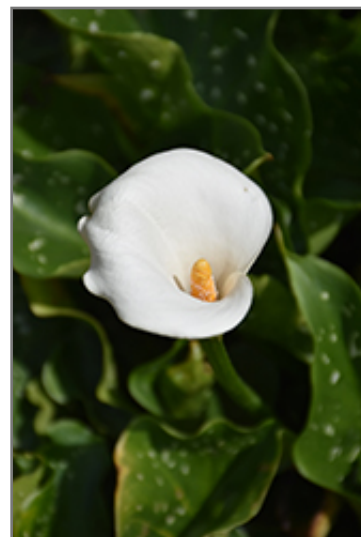
Calla Lily flowers

This variety forms a sturdy mound of leathery, shiny green arrow shaped leaves, bearing stems of white, funnel shaped flowers with a yellow spadix; a classic at weddings; likes to be kept evenly moist; a beautiful indoor accent plant