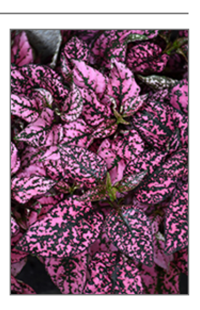
Splash Select Pink Polka Dot Plant foliage

There are many factors that will affect the ultimate height, spread and overall performance of a plant when grown indoors; among them, the size of the pot it's growing in, the amount of light it receives, watering frequency, the pruning regimen and repotting schedule. Use the information described here as a guideline only; individual performance can and will vary. Please contact the store to speak with one of our experts if you are interested in further details concerning recommendations on pot size, watering, pruning, repotting, etc.