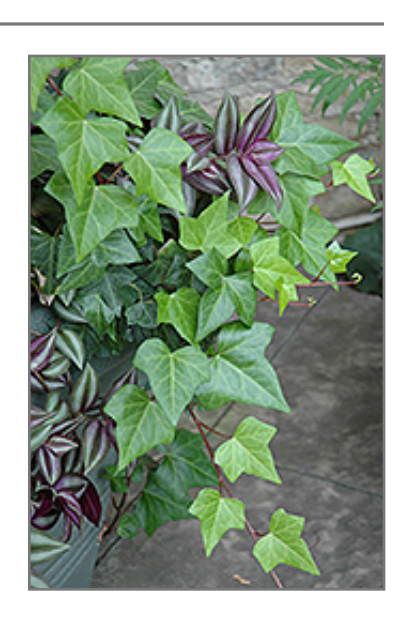
Algerian Ivy foliage

There are many factors that will affect the ultimate height, spread and overall performance of a plant when grown indoors; among them, the size of the pot it's growing in, the amount of light it receives, watering frequency, the pruning regimen and repotting schedule. Use the information described here as a guideline only; individual performance can and will vary. Please contact the store to speak with one of our experts if you are interested in further details concerning recommendations on pot size, watering, pruning, repotting, etc.