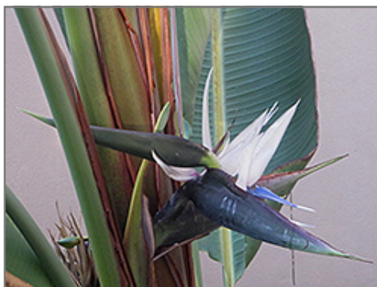
White Bird Of Paradise flowers

This is a multi-stemmed evergreen houseplant with an upright spreading habit of growth. Its wonderfully bold, coarse texture is quite ornamental and should be used to full effect. You may trim off the flower heads after they fade and die to encourage repeat blooming.