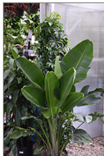
White Bird Of Paradise