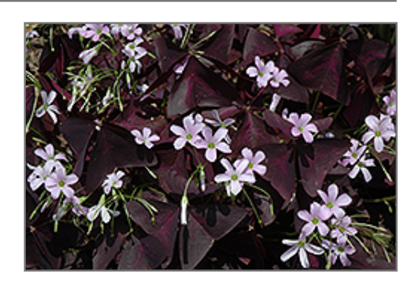
Purple Shamrock flowers

When grown indoors, Purple Shamrock can be expected to grow to be only 6 inches tall at maturity extending to 8 inches tall with the flowers, with a spread of 6 inches. It grows at a medium rate, and under ideal conditions can be expected to live for approximately 10 years. This houseplant will do well in a location that gets either direct or indirect sunlight, although it will usually require a more brightly-lit environment than what artificial indoor lighting alone can provide. It is very adaptable to both dry and moist soil, but will not tolerate any standing water. The surface of the soil shouldn't be allowed to dry out completely, and so you should expect to water this plant once and possibly even twice each week. Be aware that your particular watering schedule may vary depending on its location in the room, the pot size, plant size and other conditions; if in doubt, ask one of our experts in the store for advice. It is not particular as to soil type or pH; an average potting soil should work just fine.