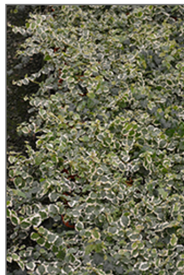
Variegated Creeping Fig in full