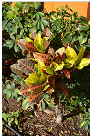
Variegated Croton