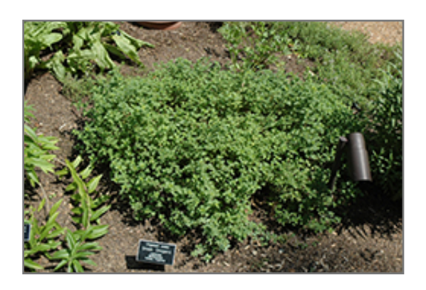
Greek Oregano

Aside from its primary use as an edible, Greek Oregano is sutiable for the following landscape applications;