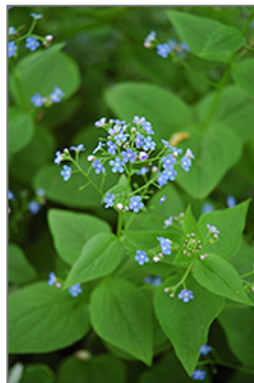
Siberian Bugloss flowers

Siberian Bugloss will grow to be about 12 inches tall at maturity extending to 16 inches tall with the flowers, with a spread of 18 inches. When grown in masses or used as a bedding plant, individual plants should be spaced approximately 15 inches apart. It grows at a medium rate, and under ideal conditions can be expected to live for approximately 10 years.