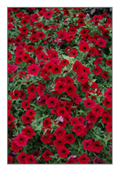
Tidal Wave Red Velour Petunia flowers