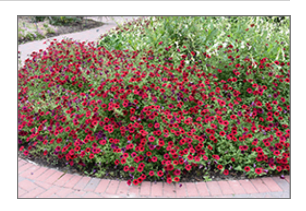
Tidal Wave Red Velour Petunia in bloom

This plant should only be grown in full sunlight. It does best in average to evenly moist conditions, but will not tolerate standing water. It is not particular as to soil type or pH. It is highly tolerant of urban pollution and will even thrive in inner city environments. This particular variety is an interspecific hybrid. It can be propagated by cuttings; however, as a cultivated variety, be aware that it may be subject to certain restrictions or prohibitions on propagation.