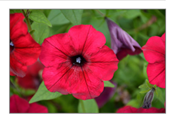
Tidal Wave Red Velour Petunia flowers