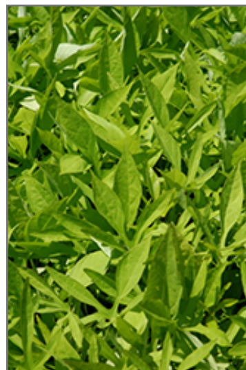
SolarPower Lime Sweet Potato Vine foliage

SolarPower Lime Sweet Potato Vine will grow to be about 12 inches tall at maturity, with a spread of 3 feet. Its foliage tends to remain dense right to the ground, not requiring facer plants in front. This fast-growing annual will normally live for one full growing season, needing replacement the following year.