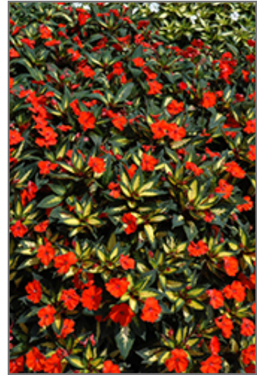
SunPatiens Spreading Tropical Orange New Guinea Impatiens flowers

SunPatiens Spreading Tropical Orange New Guinea Impatiens is a fine choice for the garden, but it is also a good selection for planting in outdoor containers and hanging baskets. It can be used either as 'filler' or as a 'thriller' in the 'spiller-thriller-filler' container combination, depending on the height and form of the other plants used in the container planting. It is even sizeable enough that it can be grown alone in a suitable container. Note that when growing plants in outdoor containers and baskets, they may require more frequent waterings than they would in the yard or garden.