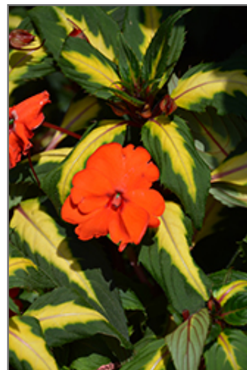
SunPatiens Spreading Tropical Orange New Guinea Impatiens flowers

SunPatiens Spreading Tropical Orange New Guinea Impatiens is recommended for the following landscape applications;