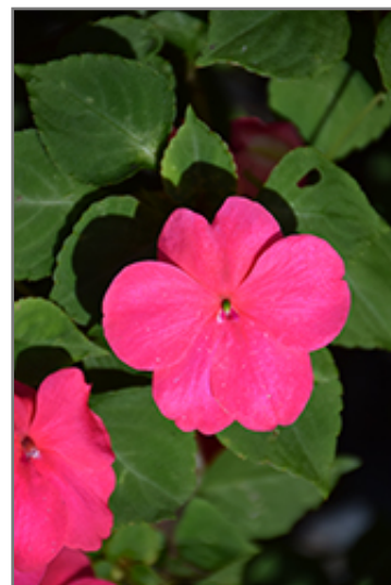
Lollipop Fruit Punch Rose Impatiens flowers