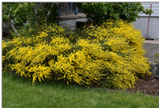
Spanish Gold Broom in bloom