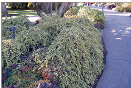
Variegated Elephant Food