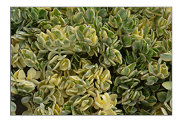
Variegated Jade Plant foliage

Variegated Jade Plant is a multi-stemmed evergreen shrub with an upright spreading habit of growth. Its average texture blends into the landscape, but can be balanced by one or two finer or coarser trees or shrubs for an effective composition.