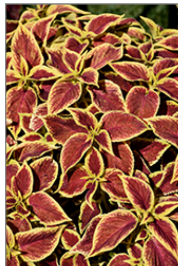
Premium Sun Crimson Gold Coleus foliage

Premium Sun Crimson Gold Coleus is recommended for the following landscape applications;