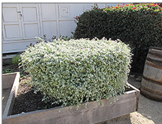
Licorice Plant