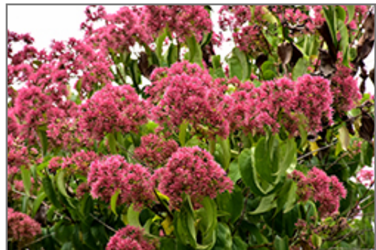
Seven-Son Flower flowers