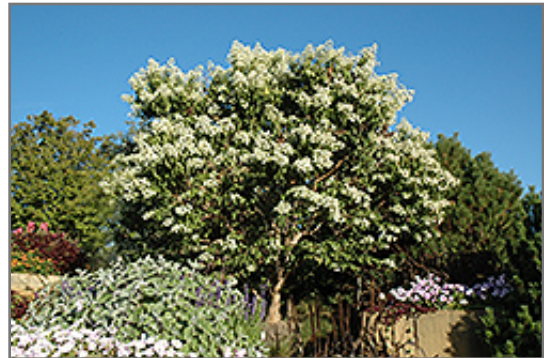
Seven-Son Flower in bloom