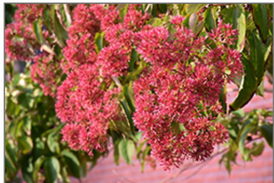
Seven-Son Flower flowers