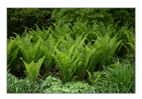
Ostrich Fern