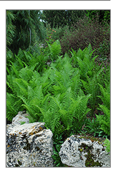
Ostrich Fern