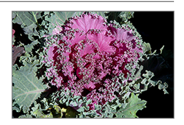
Pink Kale flowers

Pink Kale will grow to be about 18 inches tall at maturity, with a spread of 18 inches. This fast-growing annual will normally live for one full growing season, needing replacement the following year.