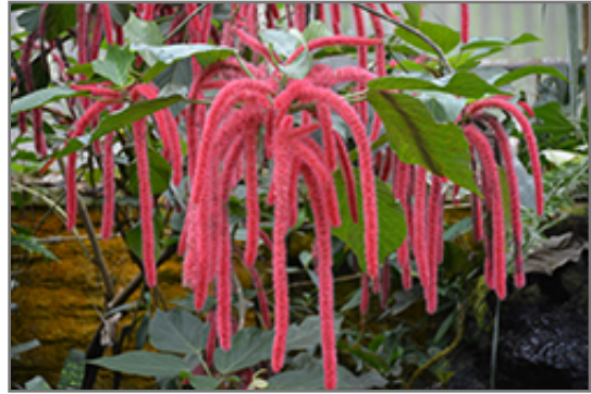
Firetail Chenille Plant flowers