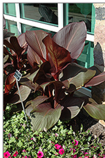
Tropicanna Black Canna

Tropicanna Black Canna is recommended for the following landscape applications;