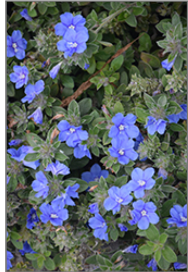
Blue My Mind Morning Glory flowers