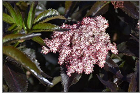
Black Tower Elder flowers

Black Tower Elder will grow to be about 8 feet tall at maturity, with a spread of 4 feet. It has a low canopy with a typical clearance of 1 foot from the ground, and is suitable for planting under power lines. It grows at a fast rate, and under ideal conditions can be expected to live for approximately 30 years.