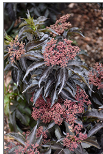
Black Tower Elder flower buds

Black Tower Elder is recommended for the following landscape applications;