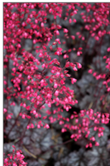
Glitter Coral Bells flowers

Glitter Coral Bells will grow to be about 10 inches tall at maturity extending to 16 inches tall with the flowers, with a spread of 14 inches. When grown in masses or used as a bedding plant, individual plants should be spaced approximately 12 inches apart. Its foliage tends to remain low and dense right to the ground. It grows at a medium rate, and under ideal conditions can be expected to live for approximately 10 years. As an evergreen perennial, this plant will typically keep its form and foliage year-round.