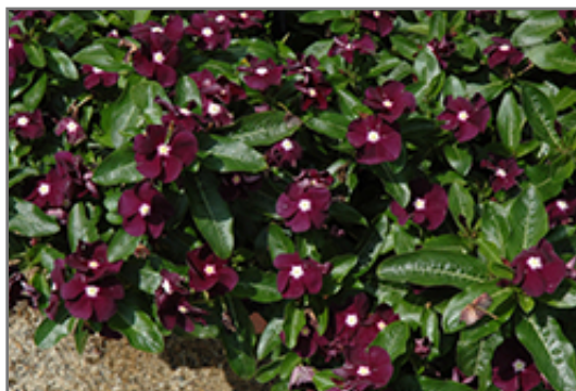
Jams 'N Jellies Blackberry Vinca flowers