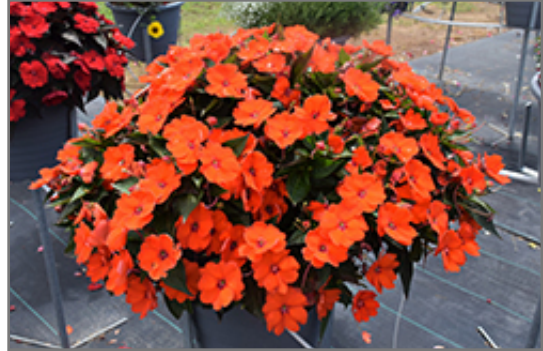
SunPatiens Compact Electric Orange New Guinea Impatiens in bloom

SunPatiens Compact Electric Orange New Guinea Impatiens will grow to be about 24 inches tall at maturity, with a spread of 24 inches. When grown in masses or used as a bedding plant, individual plants should be spaced approximately 20 inches apart. Its foliage tends to remain dense right to the ground, not requiring facer plants in front. This fast-growing annual will normally live for one full growing season, needing replacement the following year.