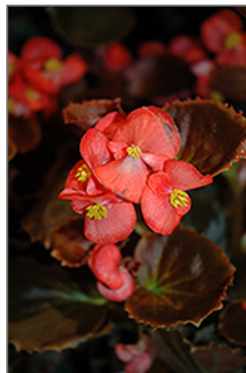
Nightife Red Begonia flowers