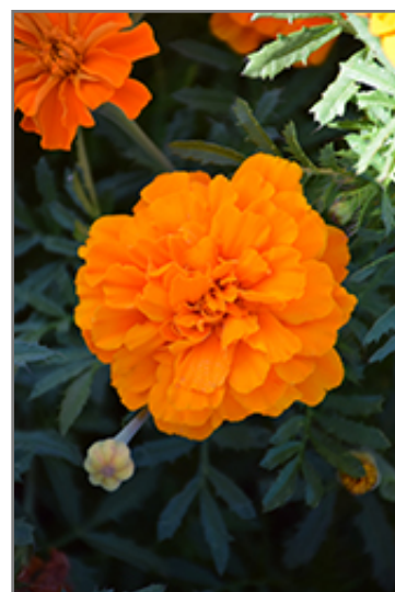
Safari Tangerine Marigold flowers