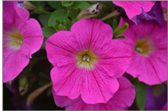
Sweetunia Hot Pink Lemonade Petunia flowers