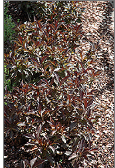
Spilled Wine Weigela