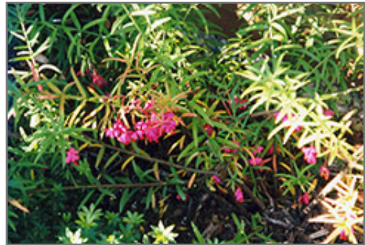
Dwarf Turkestan Burning Bush flowers

This shrub performs well in both full sun and full shade. It is very adaptable to both dry and moist locations, and should do just fine under typical garden conditions. It is not particular as to soil type or pH. It is highly tolerant of urban pollution and will even thrive in inner city environments. This is a selected variety of a species not originally from North America.