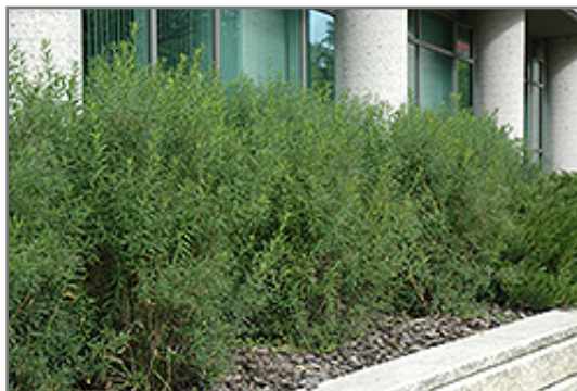
Dwarf Turkestan Burning Bush