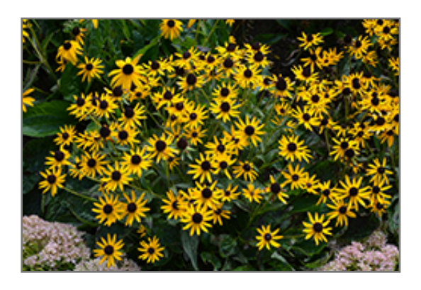
Little Goldstar Coneflower in bloom

Little Goldstar Coneflower is recommended for the following landscape applications;