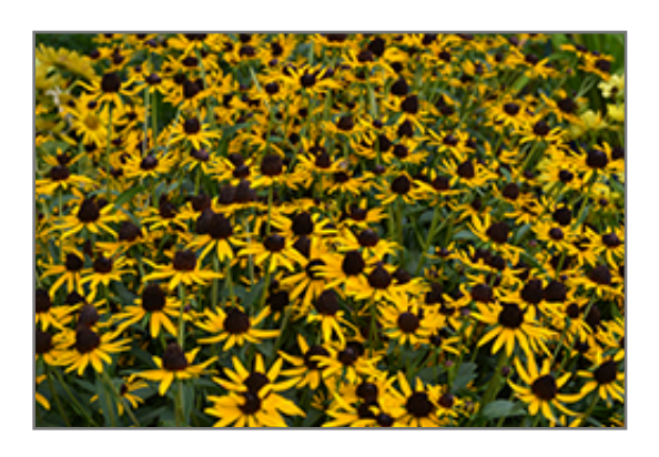
Little Goldstar Coneflower flowers