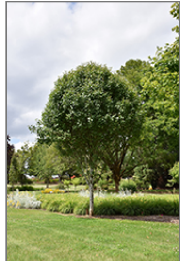
Jack Ornamental Pear

This tree should only be grown in full sunlight. It prefers to grow in average to moist conditions, and shouldn't be allowed to dry out. It is not particular as to soil type or pH. It is highly tolerant of urban pollution and will even thrive in inner city environments. This is a selected variety of a species not originally from North America.