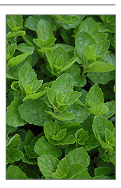
Spearmint foliage

Aside from its primary use as an edible, Spearmint is sutiable for the following landscape applications;