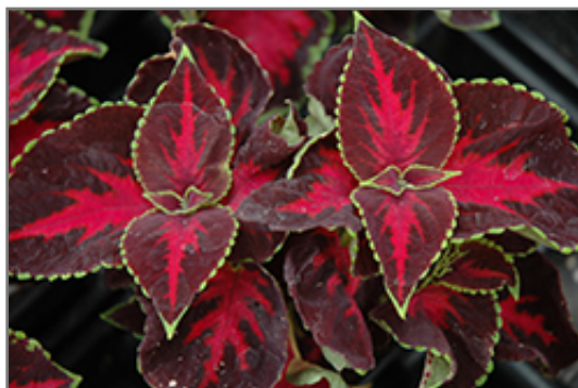
Chocolate Covered Cherry Coleus foliage