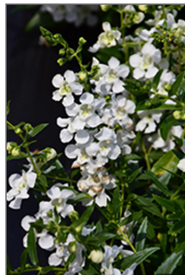
AngelMist Spreading White Angelonia flowers

AngelMist Spreading White Angelonia is recommended for the following landscape applications;