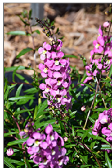
AngelMist Spreading Pink Angelonia flowers

AngelMist Spreading Pink Angelonia is recommended for the following landscape applications;