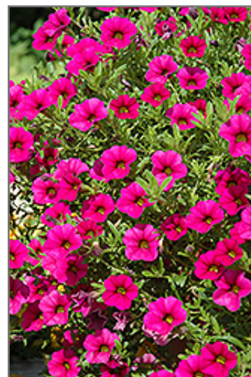
Cabaret Rose Calibrachoa flowers