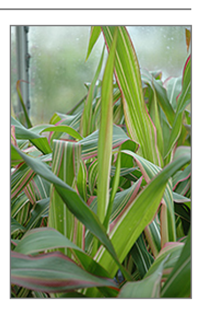
Field Of Dreams Ornamental Corn foliage

This plant does best in full sun to partial shade. It prefers to grow in average to moist conditions, and shouldn't be allowed to dry out. It is not particular as to soil type or pH. It is somewhat tolerant of urban pollution. This is a selection of a native North American species.